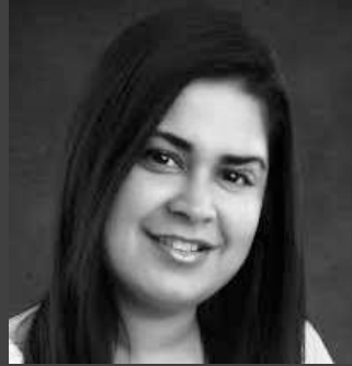
Dr. Madhuri Agarwal Aesthetics